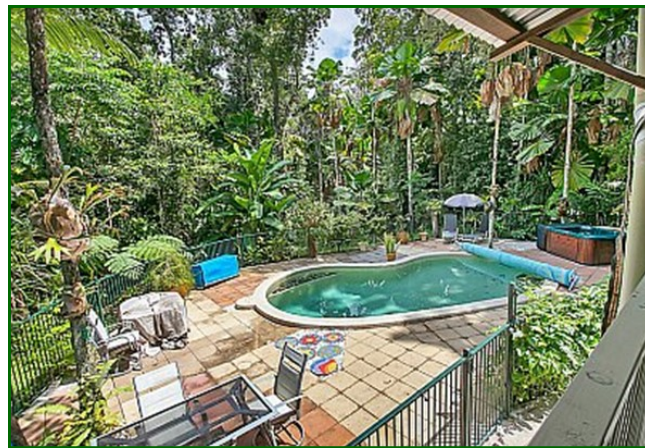
A modern Cairns backyard

Outdoor living became popular and new tropical plants which emphasized form, shape, colour and texture were important. Resort style gardens with backyard pools became popular and gardens changed from being productive, to having aesthetic appeal and being for pleasure and leisure.