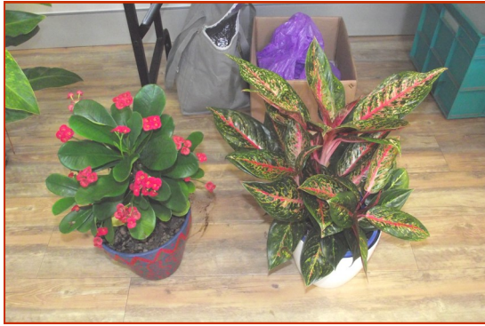
More of the awesome entries in the monthly competition at the February meeting