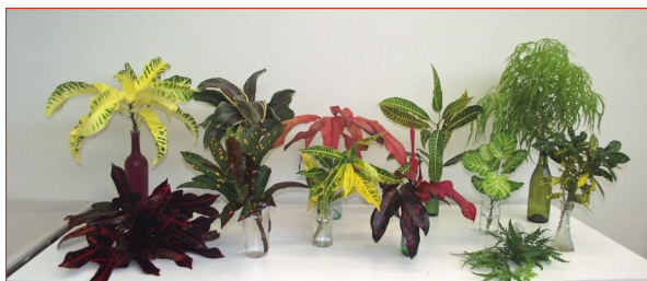
Competition entries at the March meeting